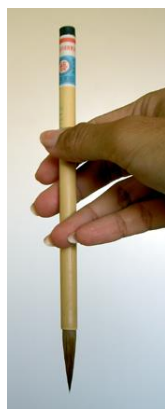
center stroke position

Position the brush vertically between your fingers. Place your index finger and middle finger behind the brush. Place the ring finger and pinky finger in front of the brush. The thumb is placed in front of the brush. This is the most stable position for painting. For center strokes, hold the brush perpendicular (90 degrees) to your painting surface. For side strokes, tilt the brush at various angles from the center stroke position.