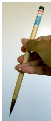
side stroke positions